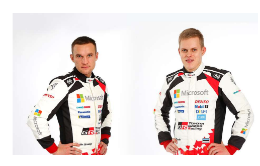
Martin Järveoja and Ott Tänak

"We are on a good run at the moment and we need to keep pushing for the best results in Spain and Australia, with all the drivers', co-driver's, and manufacturers' titles in our sights. We have been preparing for Spain just as planned, with our pre-event tests on both gravel and asphalt. The mix of surfaces can mean that this is a tricky rally to get right, but we are confident in how our car performs on both types of road. At the same time, we are taking nothing for granted and everyone is working hard to provide our drivers with the strongest car possible."