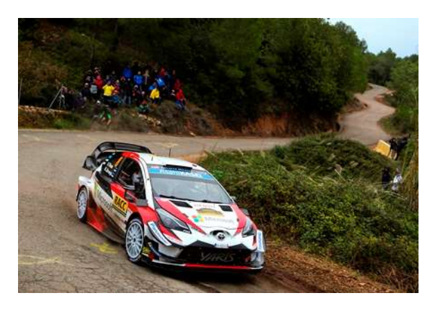
Yaris WRC Rally de España 2018

Ott Tänak led the rally until a flat tyre on Saturday morning relegated him down the order. On the final day he was able to move up to sixth overall and post the best time on the Power Stage. Jari-Matti Latvala fought for the victory before contact with a barrier damaged a wheel and left him to finish eighth, one place behind Esapekka Lappi.